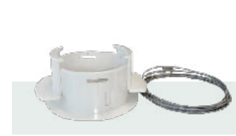
CQC Ceiling flange, 2.0m hanging wire and terminal block.