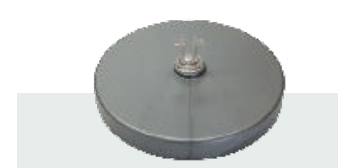
CQG Round disk base with joiner.