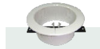
CQCD Cirqlate in-desk flange with under desk mounting bracket