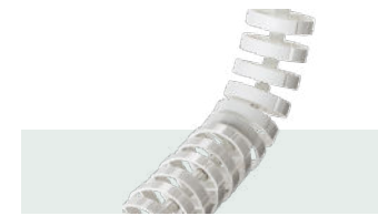
CQ70 Cirqlate 700mm section