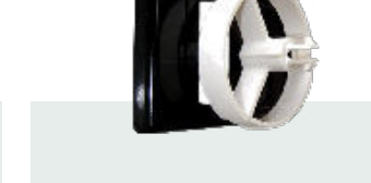
CQW Wall mounted base with joiner