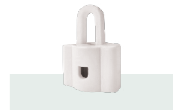
CQH Top hook for false ceiling mount (white only)