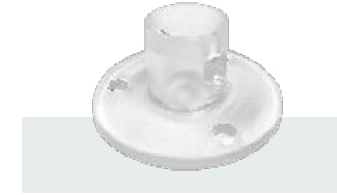
CQD Mounting foot