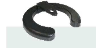
CQB Floor base c/w joiner