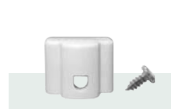
CXD Mounting foot under desk