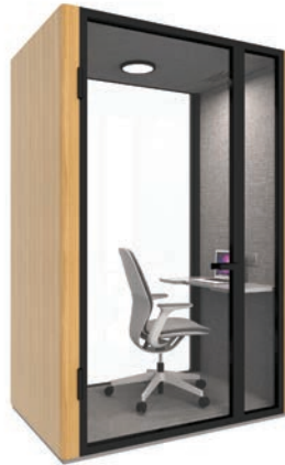
Custom Order Only