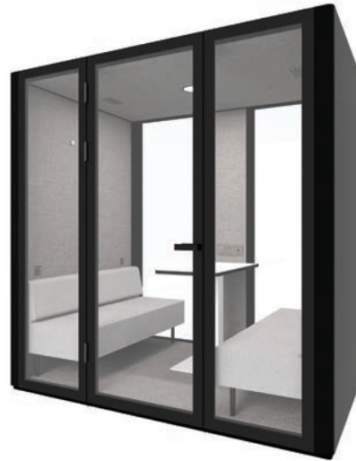
SKU: BQ-MPOD BL-GP18-BK