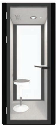
Front View with Door