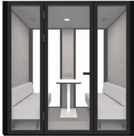
Front View with Door