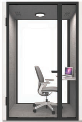
Front View with Door