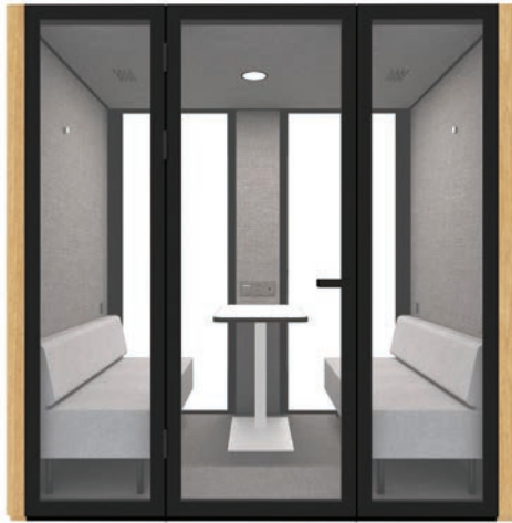
Front View with Door