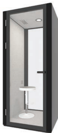
SKU: BQ-SPOD BL-GP18-BK